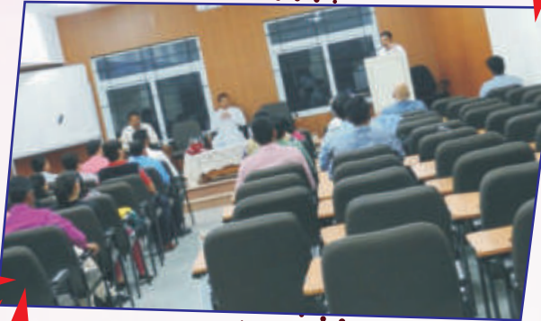
Air-conditioned Auditoriums for internal and external programs