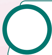
AICTE Nominee South Western Regional Office