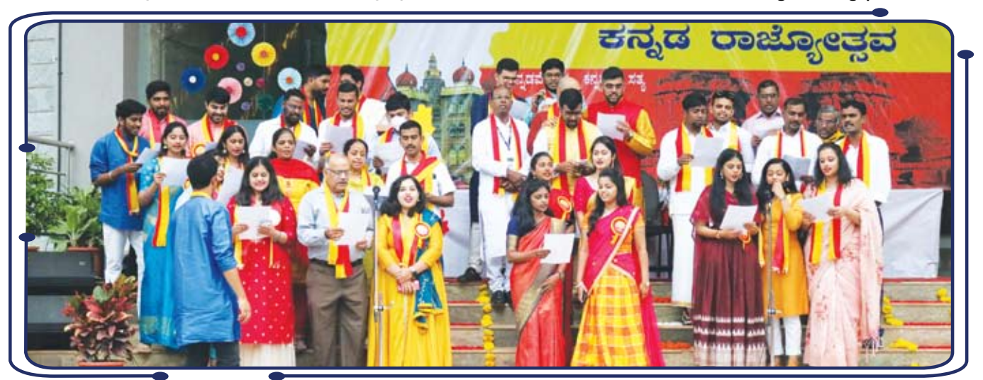
Kannada Rajyotsava Celebration

SJIM celebrated Kannada Rajyotsava 2021 on November 26, 2021, with great energy and enthusiasm. Kannada Rajyotsava is also known as 'Karnataka Formation Day'. The festival includes Kannada flag hoisting, processions,