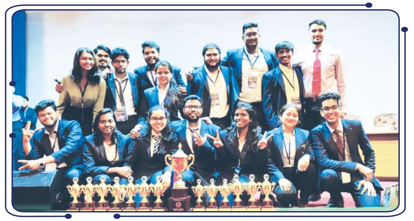
Winners and Runners-up of SYNECTICS – 2K22

The students of SJIM PGDM program participated in SYNECTICS – 2K22: a National Level Business Fest