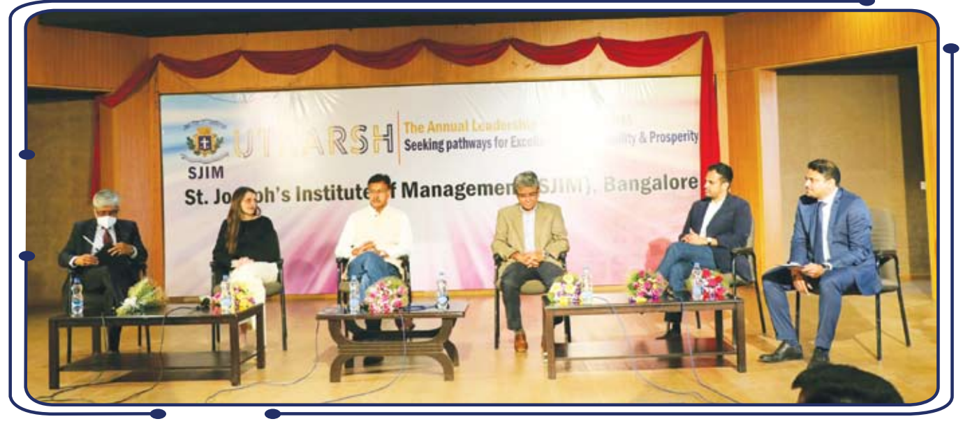
International Conference – UTKARSH 2022

THE ANNUAL NEWSLETTER FROM ST JOSEPH'S INSTITUTE OF MANAGEMENT