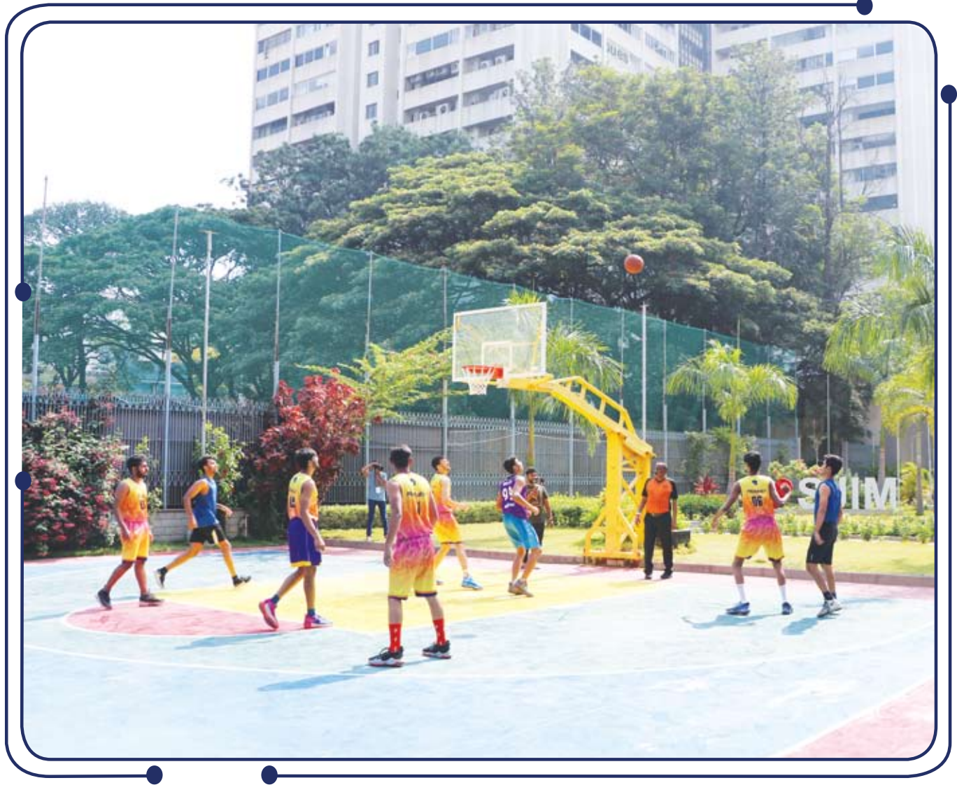
Fr. Rebello Basketball Tournament

organized by Kristu Jayanti College (KJC), Bangalore. This platform enabled students to implement their knowledge and skills in a real time scenario.