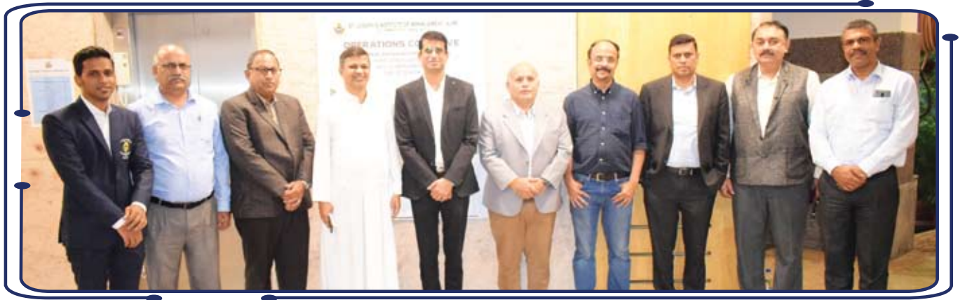
Operations Conclave 2021