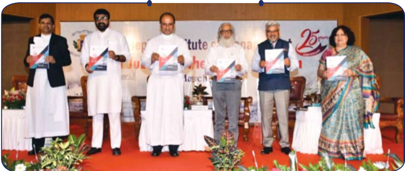
Unveiling of the Silver Jubilee Souvenir